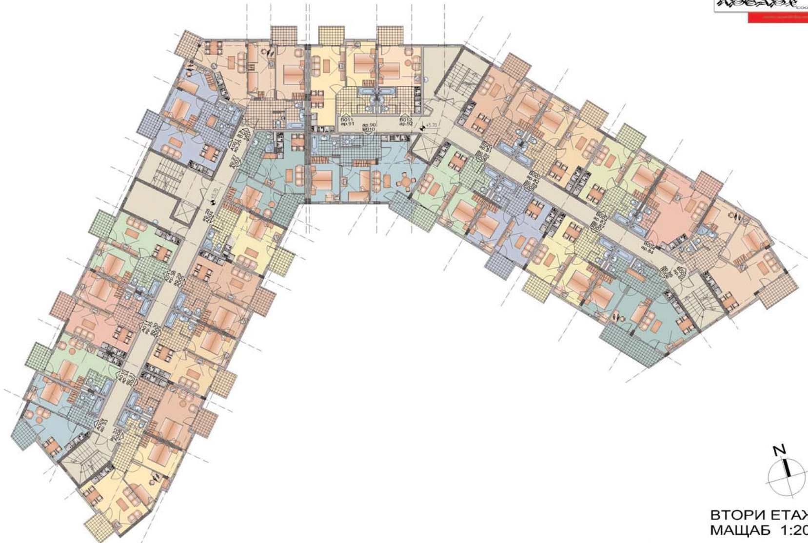
BANSKO-APARTMENT HOUSE SECOND FLOOR